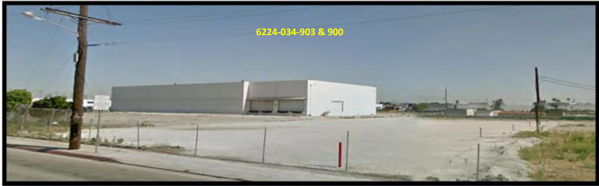
Photograph of 4819 Patata Street Front Gate