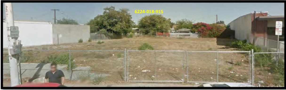
8110 South Atlantic Ave. Front gated area of the land.