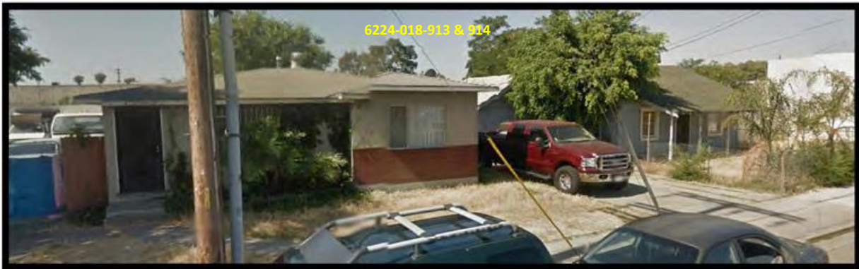
Front of 4720 Santa Ana Street residence