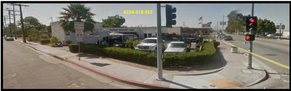
Cross streets: 8100 South Atlantic Avenue and Santa Ana Street